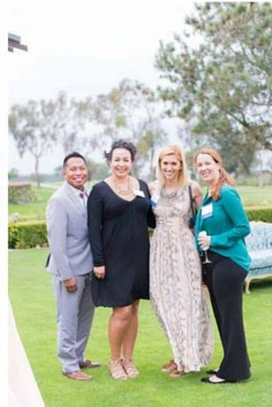
Our Annual Member Cruise evening of fun to say THANK YOU for being a member and if you aren't a member yet, a night out on Hornblower Cruise! Attendees enjoyed a perfect Californian Summer evening out on the harbor where they relaxed and enjoyed connecting with industry friends as the sunset out on Pacific.